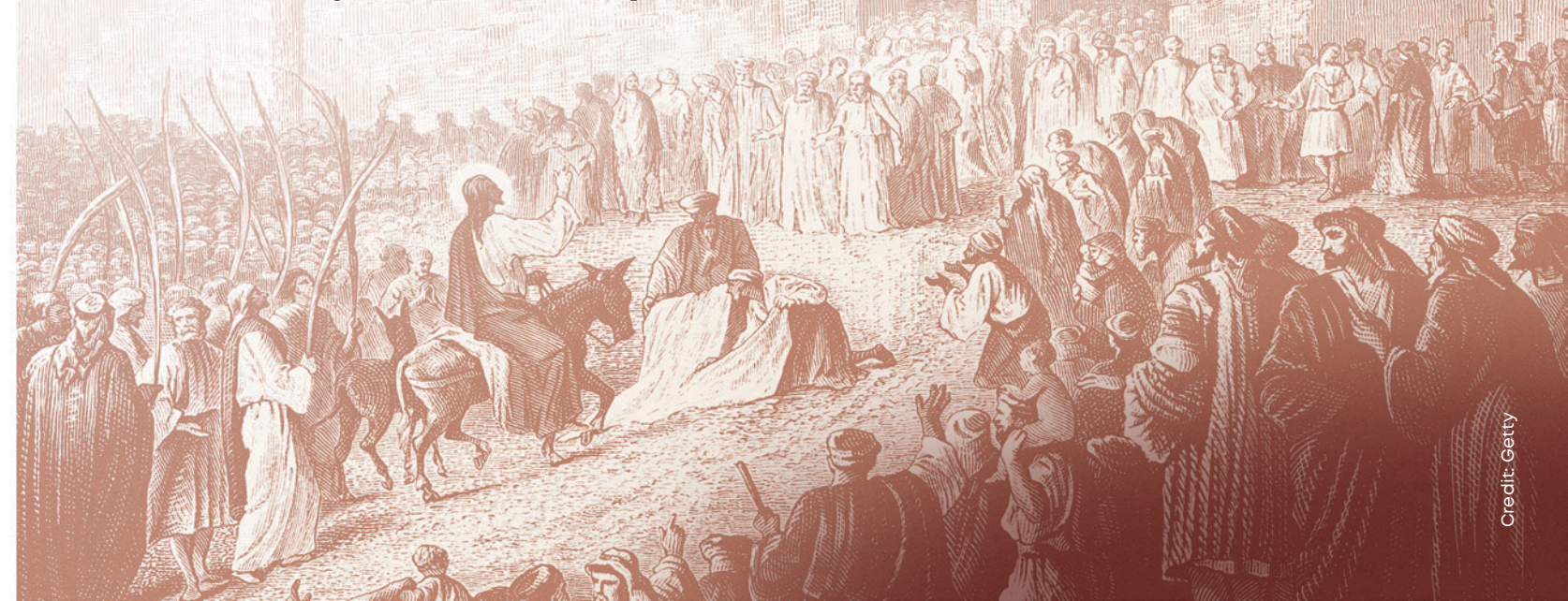
Yeshua’s Triumphal Entry to Jerusalem

To be continued next month: The Word of God among the Gentiles