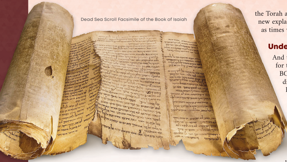
Dead Sea Scroll Facsimile of the Book of Isaiah

the Torah and the prophets needed new explanations and applications as times were changing.