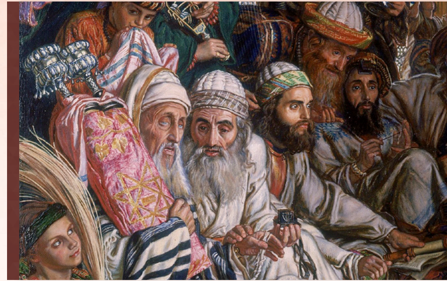
Above: The Pharisees by William Holman Hunt

But then the prophetic Word from the mouth of God became silent for four centuries. The Levites faded away, and different spiritual leaders rose up to reshape the Jewish religion according to their own understanding. They decided