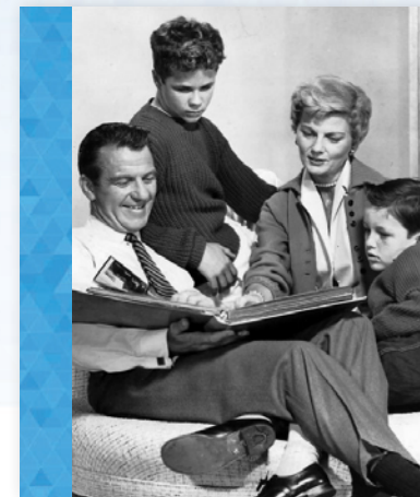
Above: The popular Leave It to Beaver TV show aired in the late 1950’s and 60’s portrayed the daily life of an ideal but not necessarily perfect family

So, if I may ask again, have you told your kids yet? ■