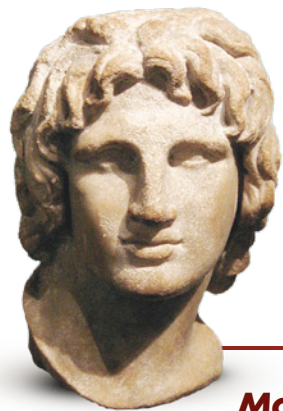
A bust of Alexander the Great

Many of the Jewish aristocratic elitists, including Israel's high priests, were receptive to the sophisticated and glamorous Greek lifestyle.