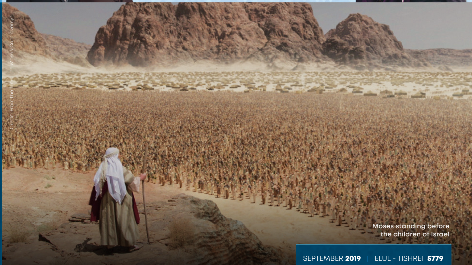
Moses standing before the children of Israel

Credit: From the film "The Moses Controversy"