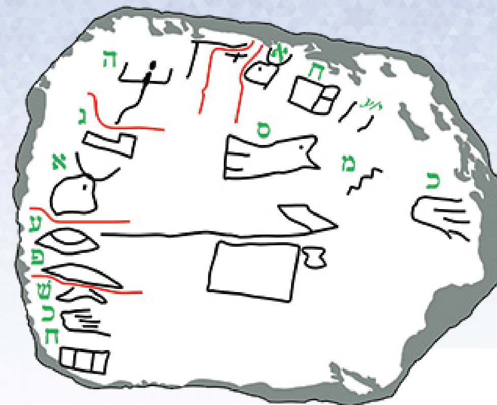
Alphabetic inscriptions on an ancient stone slab have been identified by a researcher as Hebrew. A drawing of the slab's inscriptions shows early Hebrew letters next to corresponding modern Hebrew letters (green).

The issue is, when did the children leave Egypt? And did Moses write the Torah in the