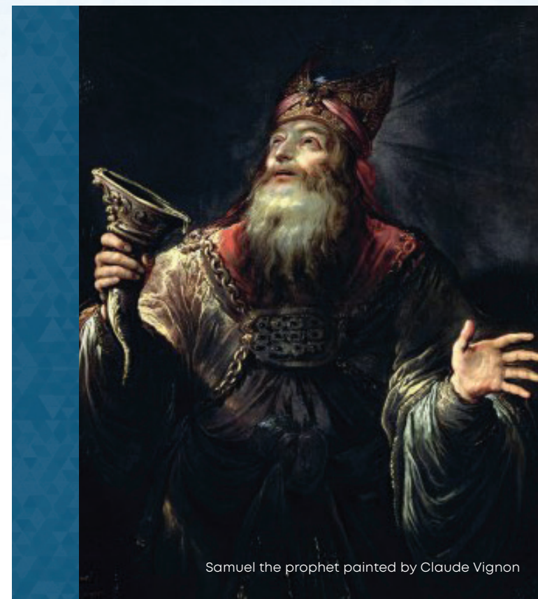
Samuel the prophet painted by Claude Vignon

In those days there was no king in Israel; everyone did what was right in his own eyes. 7