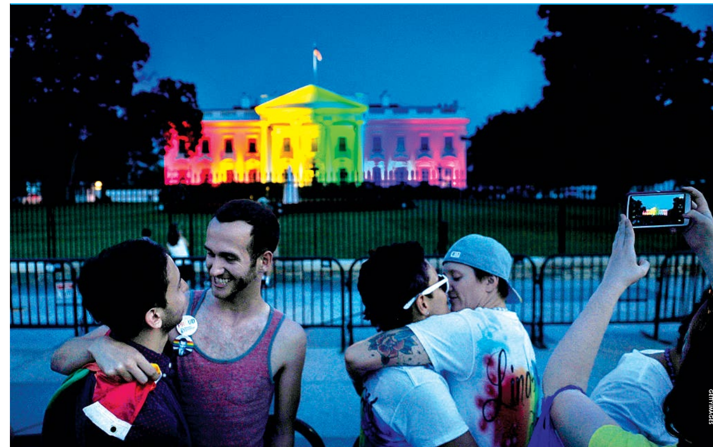
THE OBAMA ADMINISTRATION LIT UP THE WHITE HOUSE IN RAINBOW COLORS WITHIN HOURS OF THE SUPREME COURT RULING ON GAY MARRIAGE. BUT IT TOOK FIVE DAYS FOR FLAGS TO BE LOWERED TO HALF MAST IN HONOR OF THE FOUR MARINES MURDERED IN CHATTANOOGA BY ISLAMIC TERRORISTS IN JULY, 2015. BEFORE HONORING THE MARINES, HE SENT OUT A STATEMENT LECTURING AMERICANS ABOUT HOW ISLAM WAS A RELIGION OF PEACE.