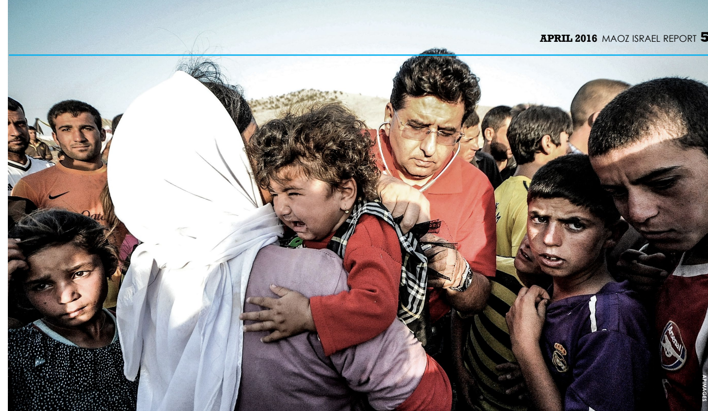
AS MILLIONS OF SYRIAN AND IRAQI MUSLIMS ARE UPROOTED AND FLEEING THEIR HOMELAND, ISRAELI MINISTRIES HAVE SENT OUT TEAMS OF MESSIANIC JEWS AND ARAB CHRISTIANS TO SURROUNDING COUNTRIES TO GIVE AID AND THE GOSPEL TO THE REFUGEES.

There is not a single Muslim state in the world where Christians are free to serve God according to the Scriptures. But I can tell you that the Christians of Egypt—representing 10% of the nation—are very thankful that the Muslim Brotherhood president Morsi was ousted. Morsi's gangs burned down churches and killed Christians with insolence. The current ruler, General Fattah El-Sisi, has done more to