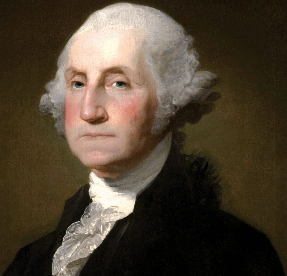
GEORGE WASHINGTON, A FOUNDING FATHER AND FIRST PRESIDENT OF THE UNITED STATES OF AMERICA. A MAN OF GOD. A MAN OF PRAYER.