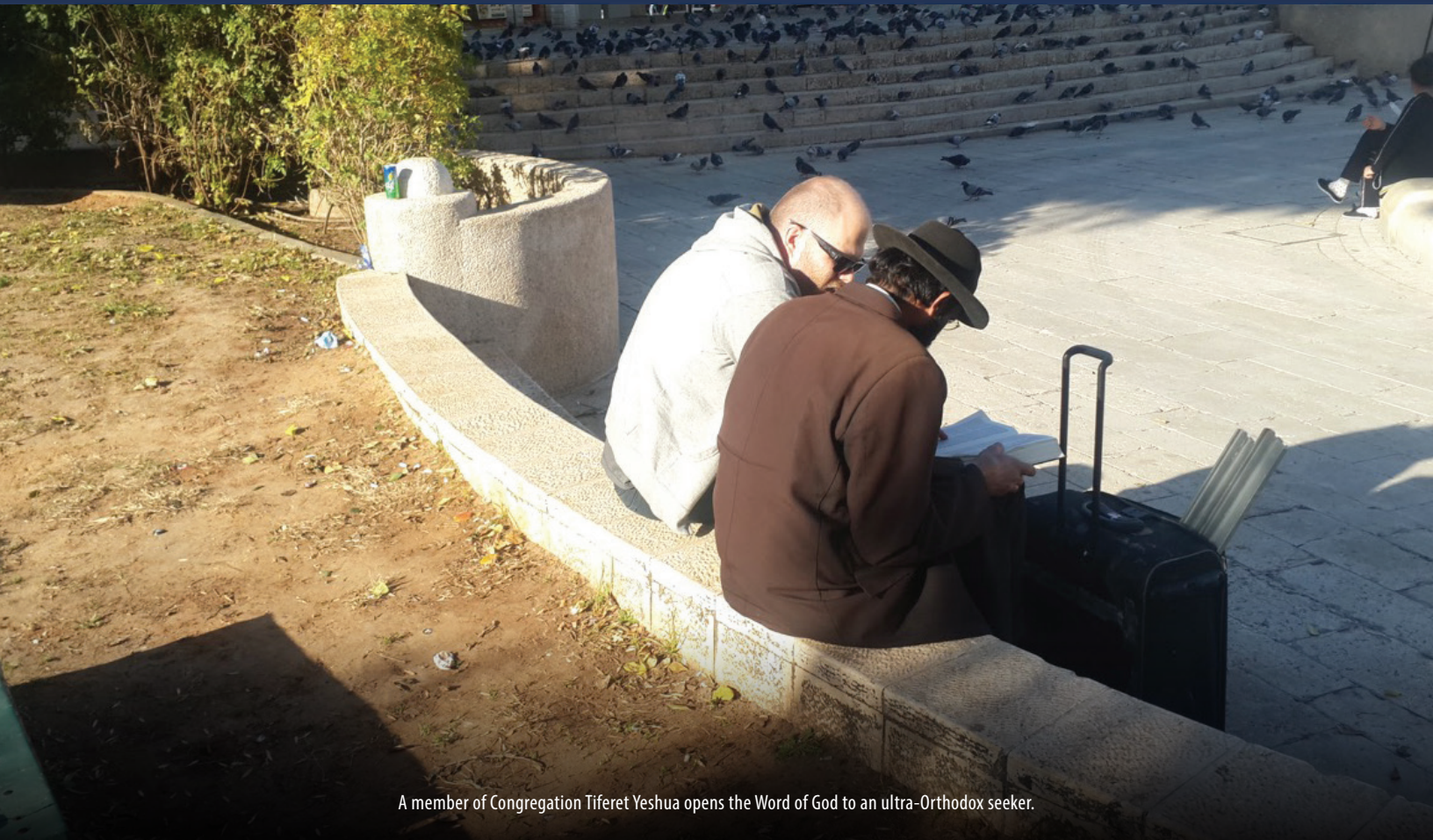
A member of Congregation Tiferet Yeshua opens the Word of God to an ultra-Orthodox seeker.