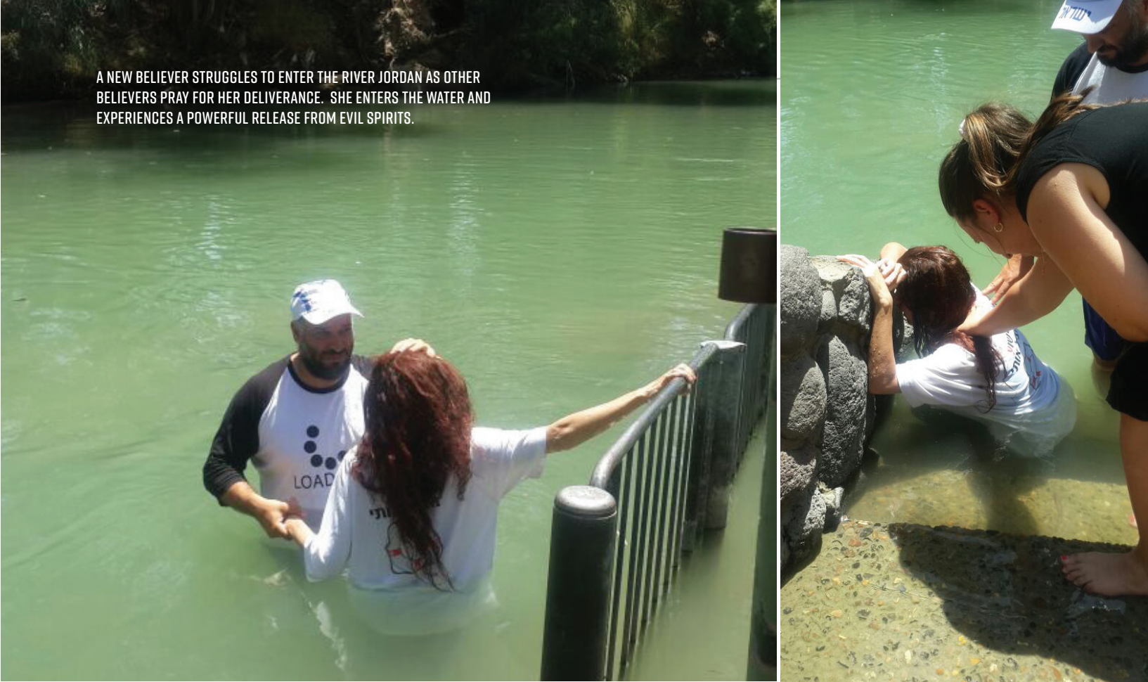
A NEW BELIEVER STRUGGLES TO ENTER THE RIVER JORDAN AS OTHER BELIEVERS PRAY FOR HER DELIVERANCE. SHE ENTERS THE WATER AND EXPERIENCES A POWERFUL RELEASE FROM EVIL SPIRITS.