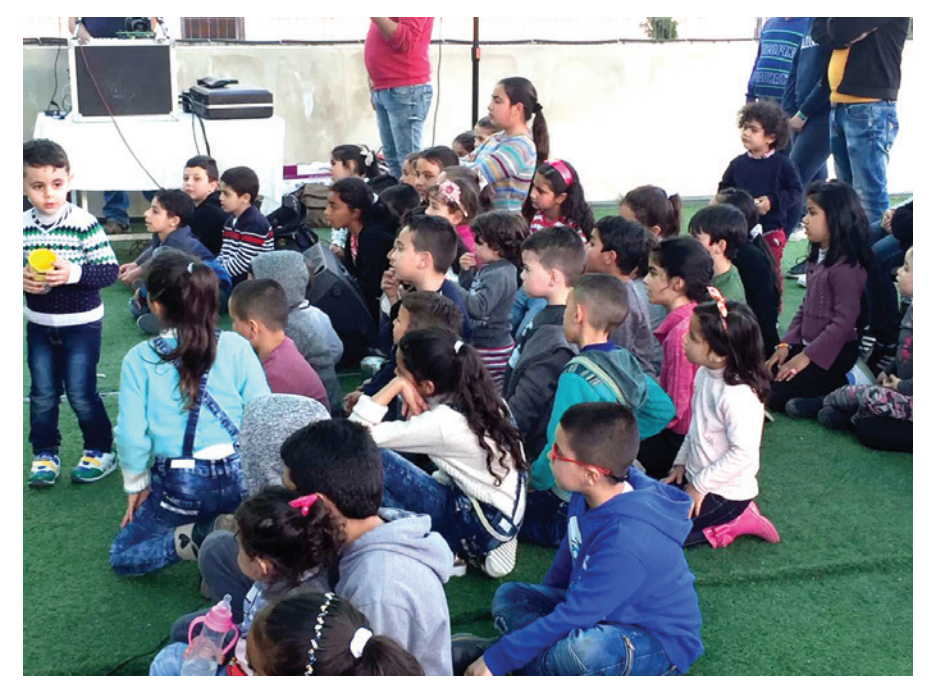
OVER 100 CHILDREN OF ETHNIC CHRISTIANS IN THE PALESTINIAN TERRITORIES HEARD THE STORY OF WHY JESUS CAME TO EARTH-TO BRING THEM SALVATION! THE CHILDREN RECEIVED GIFTS IN HONOR OF EASTER.