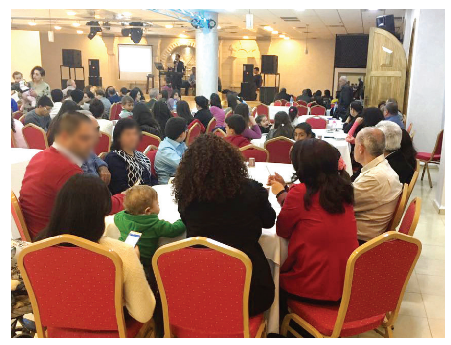
ARAB EVANGELISTS BRING TOGETHER ETHNIC CHRISTIANS FROM A NUMBER OF PALESTINIAN VILLAGES TO A HOTEL TO PREACH THE MEANING OF EASTER. OVER A HUNDRED ETHNIC CHRISTIANS GATHERED FOR THIS MEETING WITH SOME MUSLIM NEIGHBORS JOINING IN THIS OUTREACH.

None of the names in the following three testimonies are original names.