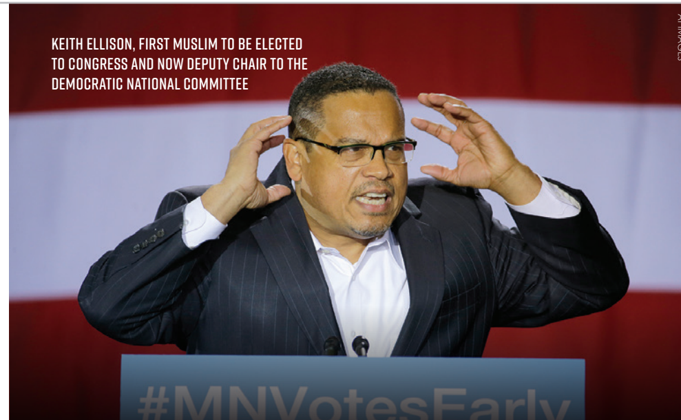
KEITH ELLISON, FIRST MUSLIM TO BE ELECTED TO CONGRESS AND NOW DEPUTY CHAIR TO THE DEMOCRATIC NATIONAL COMMITTEE

But in America it is very different. Jewish Americans are indeed honed in to identifying racist anti-Semites. And all Christians must also be alert to every sign of bigotry against the Jewish people. It is clear that there has been a rise in anti-Semitic threats and attacks from white supremacists over the last few months. This is intoler-