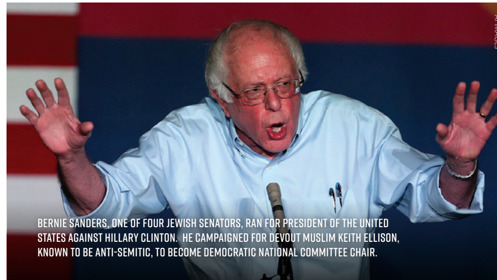
BERNIE SANDERS, ONE OF FOUR JEWISH SENATORS, RAN FOR PRESIDENT OF THE UNITED STATES AGAINST HILLARY CLINTON. HE CAMPAIGNED FOR DEVOUT MUSLIM KEITH ELLISON, KNOWN TO BE ANTI-SEMITIC, TO BECOME DEMOCRATIC NATIONAL COMMITTEE CHAIR.