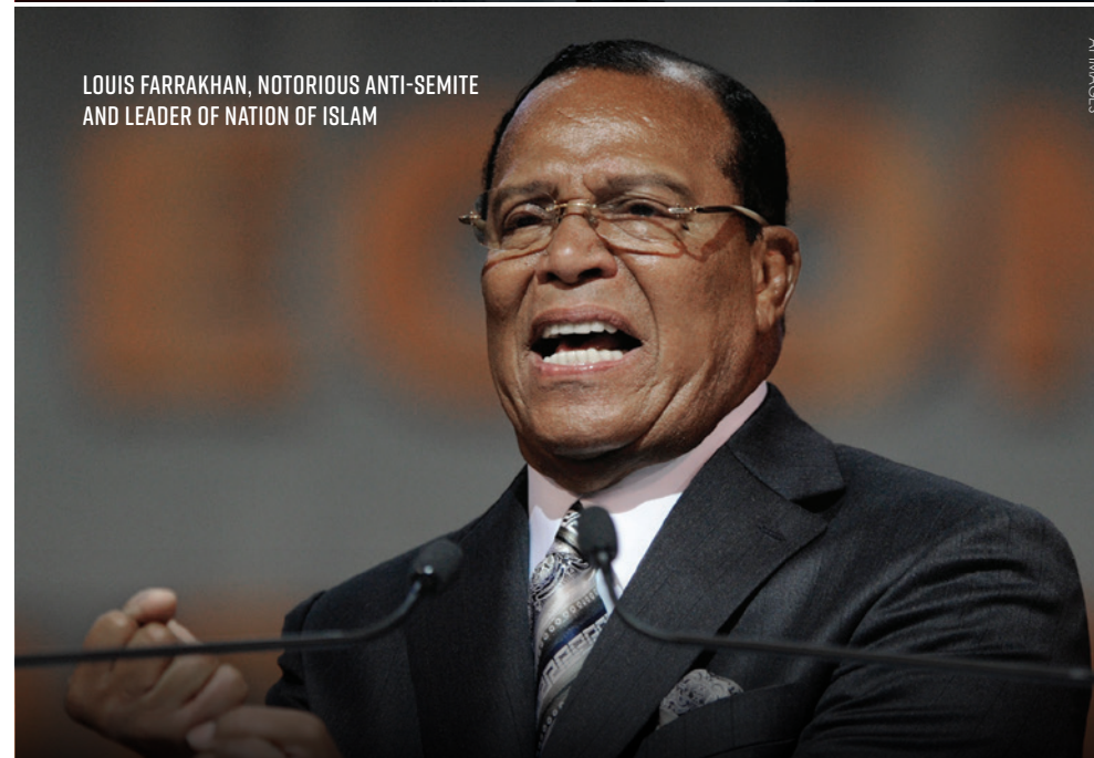
LOUIS FARRAKHAN, NOTORIOUS ANTI-SEMITIC AND LEADER OF NATION OF ISLAM