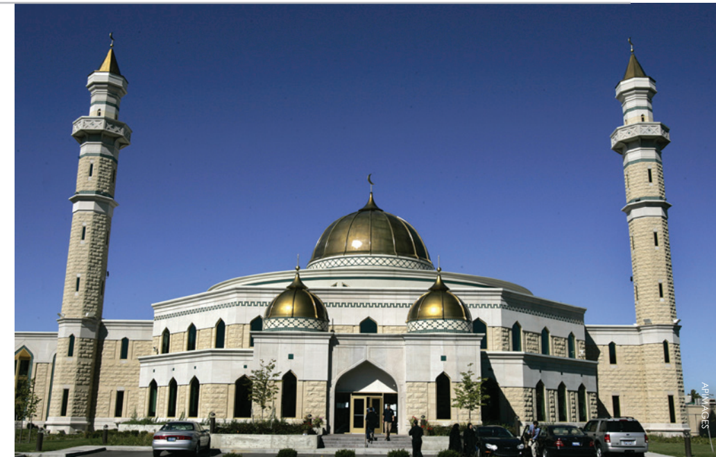
MOSQUE IN DEARBORN, MICHIGAN, ONE OF 2300 MOSQUES NOW IN THE UNITED STATES

But what every American Christian should know is that many Jews who survived the Holocaust and who came to America as refugees from Europe or elsewhere, lived that exact same trauma resulting from the atrocities committed by Christianity and Nazism that I observed in Israel. The difference was that