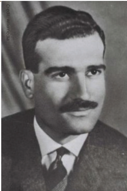
Eli Cohen, Israeli spy whose intelligence greatly helped Israel to scale in two days the 'impenetrable fortifications' on the slopes of the Golan Heights.

But Israel's history in Golan doesn't end there.